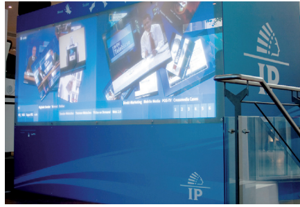
Easily changeable side panels allow branding with customer logos.