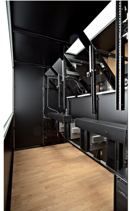
MultiTouch Box inside view.