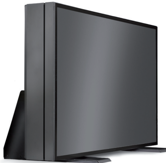
Single display unit 42" – side view