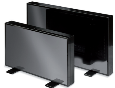
Display is available both in 42" and 55" sizes.