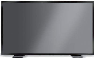
Single display unit 42" – frontal view