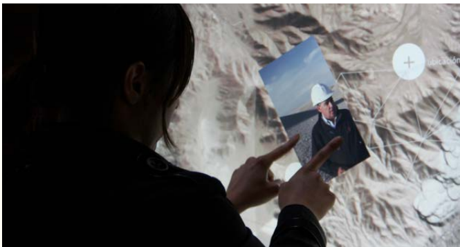
Corporate Communications: Chuquicamata Underground Mining Project, Chile // Riolab