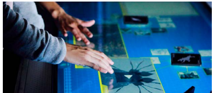
Exhibitions: Experience Music Project and Science Fiction Museum, Seattle, Washington, USA // Snibbe Interactive