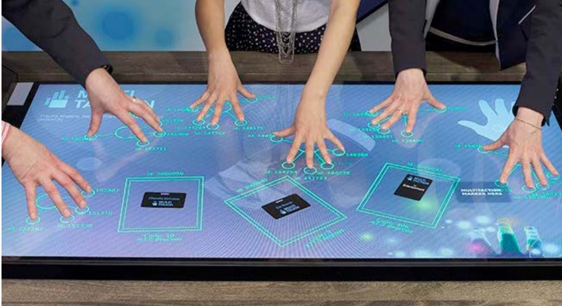
Hand tracking allows natural gestures and multi-user interactions.

Unmatched multi-user capability and wide choice of development tools and platforms