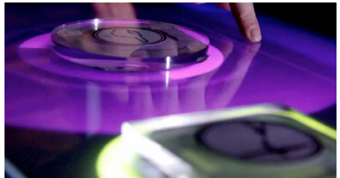
Entertainment: Sekuensaa - playing music with markers, xaxMadrid, Spain // Sensaa