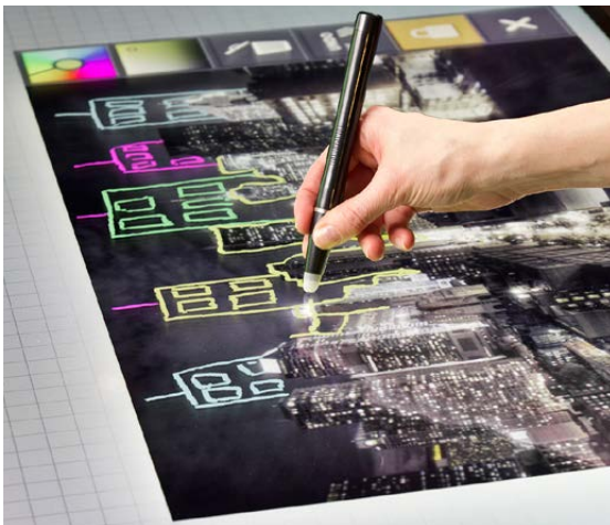
Use simultaneously with pen and touch.