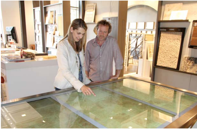
Retail: ACME Brick, USA // [wire]stone

MultiTouch displays are used around the world for a wide range of purposes