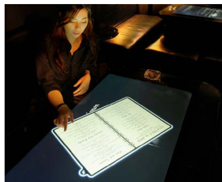
Hospitality: Graffiti Bar, Tokyo, Japan // Green Light Production