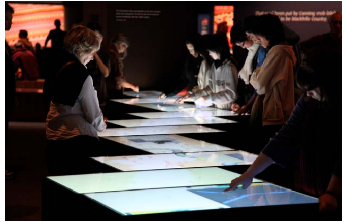
Museums: National Museum of Australia, Canberra, Australia // Lightwell