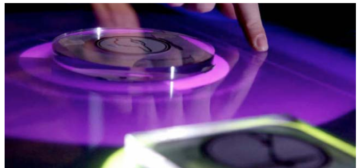
Entertainment: Sekuensaa - playing music with markers, Madrid, Spain // Sensaa