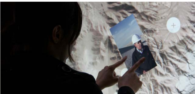
Corporate Communications: Chuquicamata Underground Mining Project, Chile // Riolab