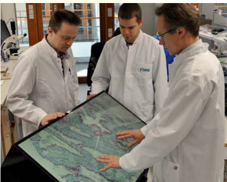
Research / Education: MultiTouch Microscope, University of Helsinki, Finland // FIMM