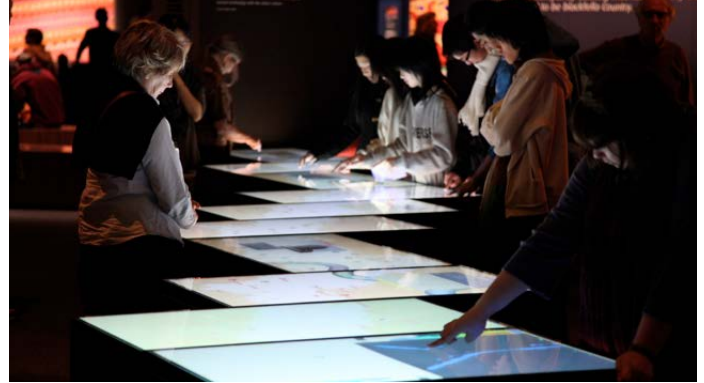
Museums: National Museum of Australia, Canberra, Australia // Lightwell