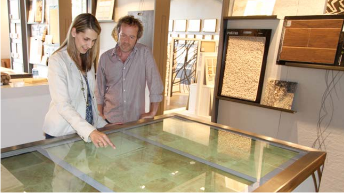
Retail: ACME Brick, USA // [wire]stone

MultiTouch displays are used around the world for a wide range of purposes