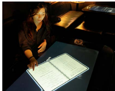
Hospitality: Graffiti Bar, Tokyo, Japan // Green Light Production