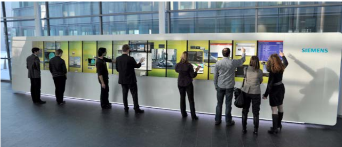
Public Information: Siemens CEE HQ, Vienna, Austria // UMA Information Technology