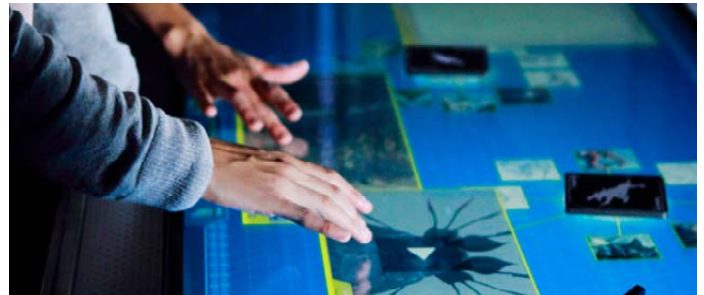
Exhibitions: Experience Music Project and Science Fiction Museum, Seattle, Washington, USA // Snibbe Interactive