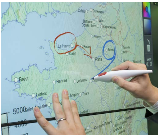
Use simultaneously with pen and touch.